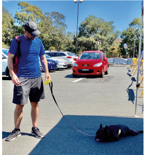
Some just plain don't want to leave!