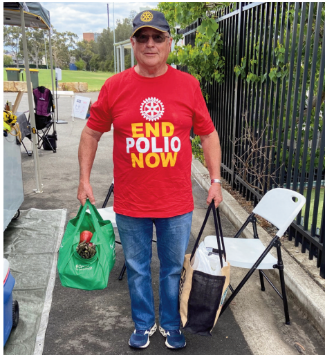
Some leave with their pockets a lot lighter!